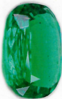
IGL FANCY COLOR SCALE